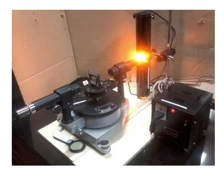
Figure 2: Schematic for diffraction of sodium Na-D lines